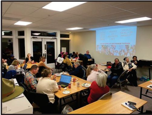
Bus drivers assembled at the QACEA office for their meeting on negotiation priorities and the ESP Bill of Rights.