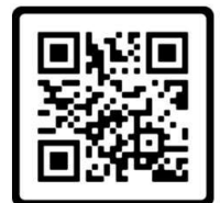
ESP Bill of Rights