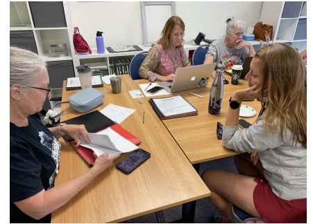
Board of Directors summer work session,

Our primary means of communicating with you is via your personal email and through your building representative. If you have yet to update your contact information please do so in order to assure you receive information in a timely way. Please respond to the survey that is coming your way regarding negotiations and ways in which you can become an advocate for yourself and your profession.